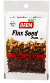
FLAX SEED - 00060 12/1.5 OZ