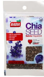
CHIA SEED - 00045 12/1.5 OZ