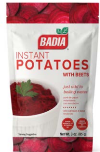
INSTANT POTATOES WITH BEETS - 01263 6/3 OZ