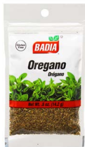
OREGANO WHOLE - 00021 12/0.5 OZ