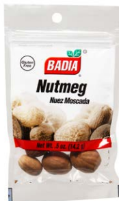
NUTMEG WHOLE - 00031 12/0.5 OZ