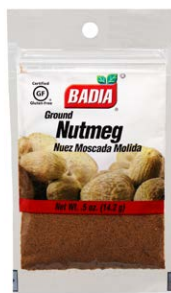
NUTMEG GROUND - 00032 12/0.5 OZ