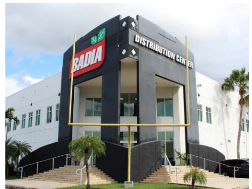
DISTRIBUTION CENTER BUILDING