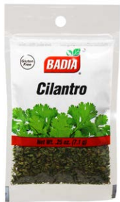
CILANTRO - 00061 12/0.25 OZ