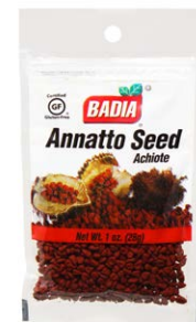
ANNATTO SEED - 00023 12/1 OZ