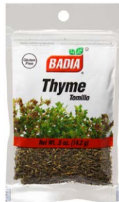
THYME LEAVES - 00209 12/0.5 OZ