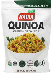
ORGANIC QUINOA - 00175 6/12 OZ

Complement your everyday meals with these beautiful and delicious side dishes.