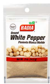
PEPPER GROUND WHITE - 00026 12/0.5 OZ