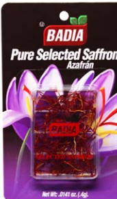
SAFFRON SPANISH - 00055 12/0.4 GM