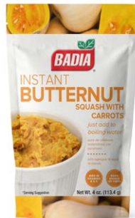
INSTANT BUTTERNUT SQUASH WITH CARROTS - 01262 6/4 OZ