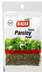
PARSLEY FLAKES - 00041 12/0.25 OZ