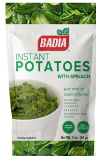
INSTANT POTATOES WITH SPINACH-01266 6/3 OZ