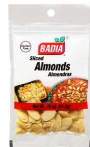
ALMONDS SLICED - 00036 12/0.75 OZ