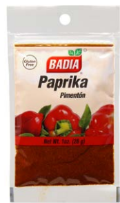
PAPRIKA - 00027 12/1 OZ