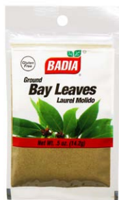
BAY LEAVES GROUND - 00020 12/0.5 OZ