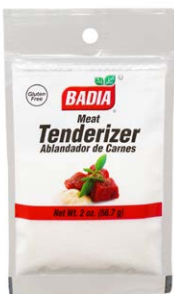
MEAT TENDERIZER - 00071 12/2 OZ