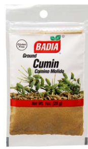
CUMIN GROUND - 00017 12/1 OZ