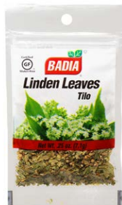
LINDEN LEAVES - 00033 12/0.25 OZ