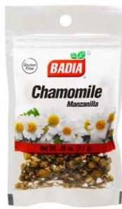
CHAMOMILE FLOWERS - 00034 12/0.25 OZ