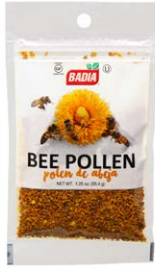
BEE POLLEN - 00082 12/1.25 OZ