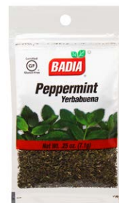
PEPPERMINT - 00059 12/0.25 OZ