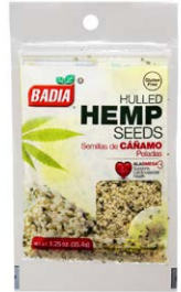
HULLED HEMP SEEDS - 00081 12/1.25 OZ