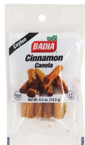
CINNAMON STICKS - 00029 12/0.5 OZ