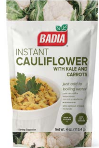
INSTANT CAULIFLOWER WITH KALE & CARROTS - 01264 6/4 OZ