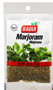
MARJORAM - 00057 12/0.25 OZ