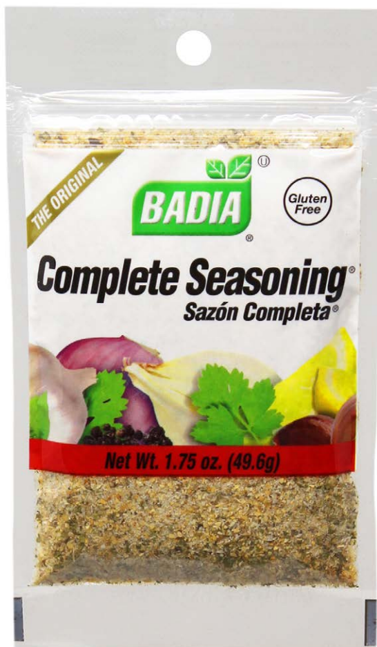
COMPLETE SEASONING® - 00099 12/1.75 OZ

This convenient and resealable size is the perfect one for the everyday needs while keeping the product fresh.