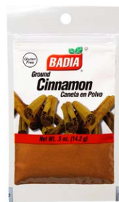
CINNAMON POWDER - 00030 12/0.5 OZ