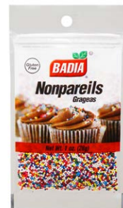
NONPAREILS - 00042 12/1 OZ