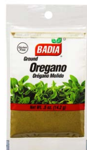
OREGANO GROUND - 00022 12/0.5 OZ