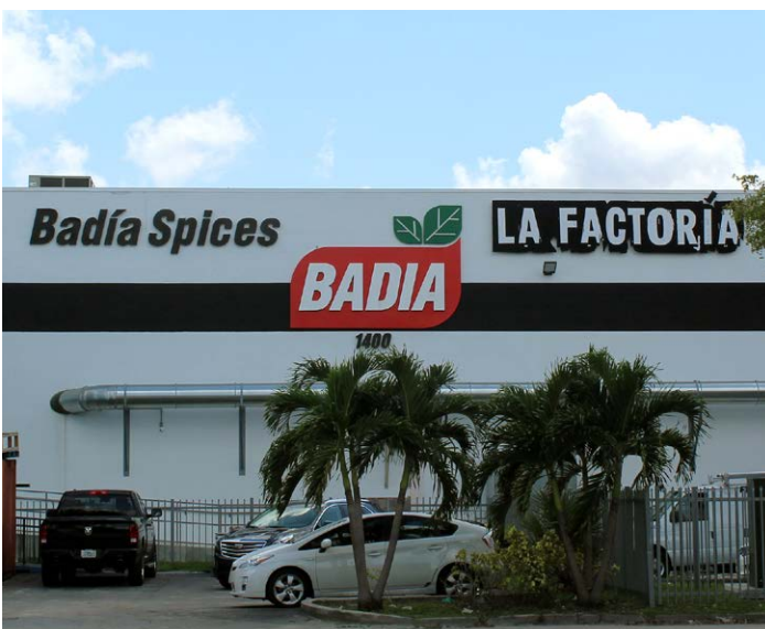
"LA FACTORIA" PRODUCTION BUILDING