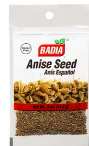
ANISE SEED - 00028 12/0.5 OZ