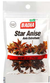
STAR ANISE - 00035 12/0.5 OZ