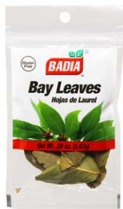
BAY LEAVES WHOLE - 00019 12/0.2 OZ