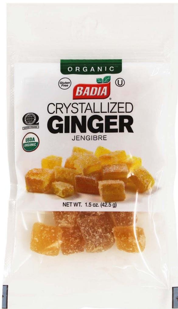
ORGANIC CRYSTALLIZED GINGER - 00083 12/1.5 OZ

From basic ingredients as Cinnamon and Cardamom "Queen of Spices", to promoting a healthy lifestyle with our Trilogy Seeds. All your healthy and organic needs you'll find them here.