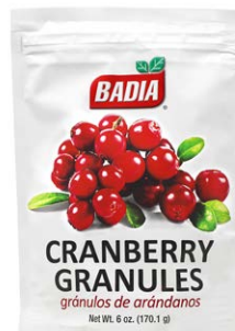
CRANBERRY GRANULES - 02127 8/6 OZ