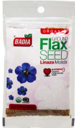
ORGANIC FLAX SEED GROUND - 00043 12/1.25 OZ