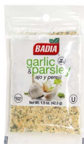
GARLIC & PARSLEY - 00076 12/1.5 OZ