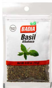
BASIL - 00072 12/0.5 OZ