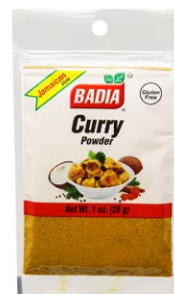
CURRY POWDER - 00074 12/1 OZ