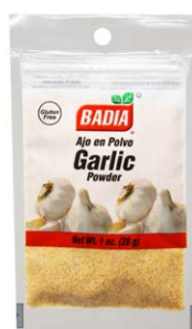
GARLIC POWDER - 00070 12/1 OZ