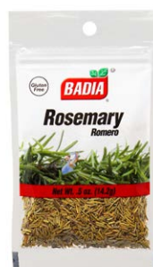
ROSEMARY - 00058 12/0.5 OZ