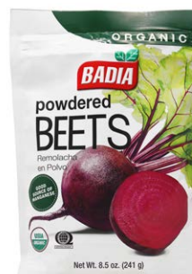
ORGANIC RED BEET - 02126 8/8.5 OZ