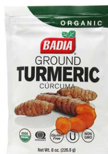
ORGANIC TURMERIC GROUND - 02129 8/8 OZ