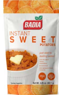
INSTANT SWEET POTATOES - 01267 6/3.25 OZ