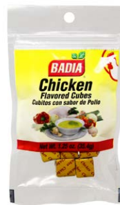
CHICKEN FLAVORED CUBES - 00077 12/1.25 OZ