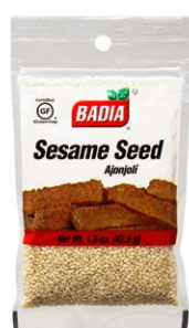
SESAME SEED HULLED - 00065 12/1.5 OZ