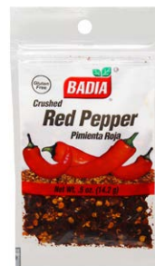
PEPPER CRUSHED RED - 00039 12/0.5 OZ