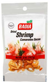
SHRIMP DRIED - 00038 12/0.5 OZ