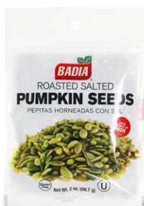
ROASTED SALTED PUMPKIN SEEDS-00738 12/2 OZ