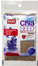
GROUND CHIA SEED - 00084 12/1 OZ