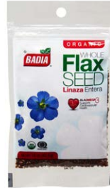
ORGANIC FLAX SEED WHOLE - 00053 12/1.5 OZ