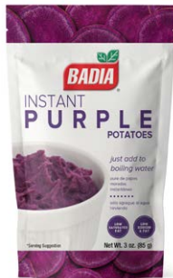
INSTANT PURPLE POTATOES - 01265 6/3 OZ