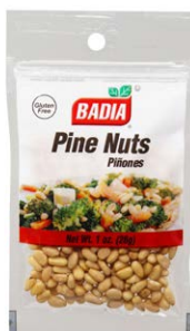
PINE NUTS - 00068 12/1 OZ