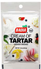
CREAM OF TARTAR - 00088 12/1.5 OZ