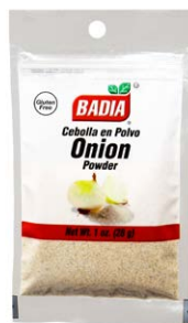
ONION POWDER - 00073 12/1 OZ