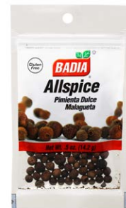
ALLSPICE WHOLE - 00040 12/0.5 OZ

The one that started it all, has the perfect combination of ingredients and spices, carefully chosen to enhance the natural flavor of your favorite food.