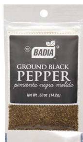
PEPPER GROUND BLACK - 00024 12/0.5 OZ