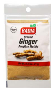
GINGER GROUND - 00075 12/0.75 OZ