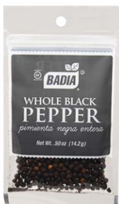
PEPPER WHOLE BLACK - 00025 12/0.5 OZ