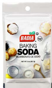
BAKING SODA - 00087 12/2 OZ