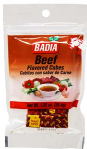
BEEF FLAVORED CUBES - 00078 12/1.25 OZ