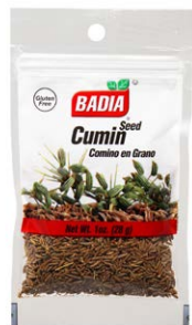
CUMIN SEED - 00018 12/1 OZ