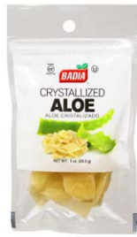
CRYSTALLIZED ALOE - 00086 12/1 OZ