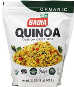
ORGANIC QUINOA - 00094 6/2 LBS