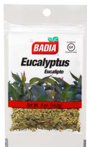
EUCALYPTUS - 00062 12/0.5 OZ