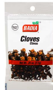
CLOVES - 00037 12/0.25 OZ